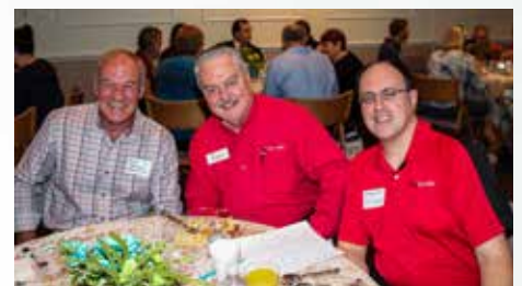
BBC Members Johnson Printing and CSI Networks attended July's Coffee Club at "Historic" Manasota Memorial Park & Funeral Home.

Held & Haddad, LLC dba Coastal Printing of Sarasota