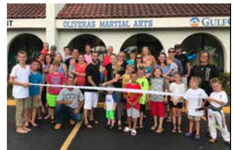
Olivera's Martial Arts Grand Opening 501 Village Green Pkwy., Ste. 20 Bradenton, FL 34209 941-242-5499 OliveraBJJ.com