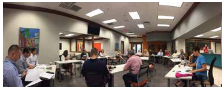
Chamber Infill Committee and Downtown Redevelopment Committee engaged in discussion to support the County's SWD Redevelopment Strategy.