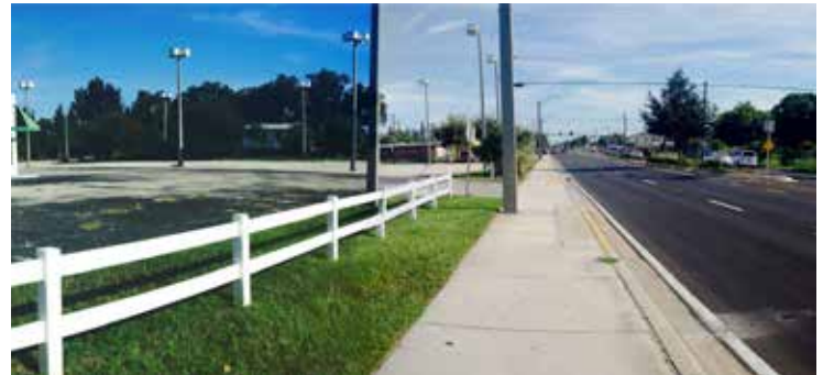
Current 14th St. W. Corridor View(above) and County Southwest District Vision of the Corridor (below).

The Chamber supports the County's initiatives to address issues related to affordable/workforce housing and we will continue to advocate for funding, policies, and programs at the state and federal level. We believe these efforts will contribute to the retention of our current and future workforce by creating economic opportunities and lifestyle choices through a diverse mix of housing options, infrastructure, multi-modal transportation, social and business opportunities.