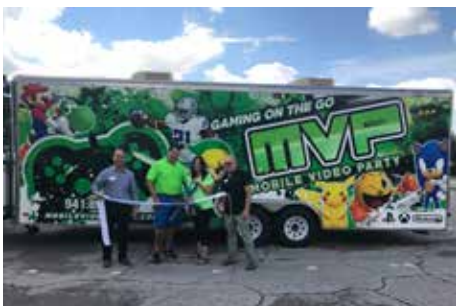
MVP (Mobile Video Party) Grand Opening mvp@mobilevideoparty.com 941-896-9227 mobilevideoparty.com