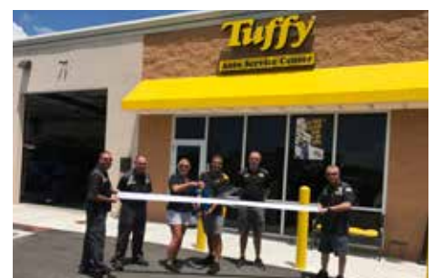
Tuffy Auto Service Center Grand Opening 6025 E. State Rd. 70 Bradenton, FL 34203 941-751-1818 tuffy.com