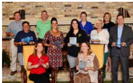
2016 Business & Education Partnership Award Winners