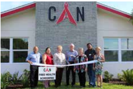
Community AIDS Network Remodel 408 7th St. W. Palmetto, FL 34221 941-366-0461 cccsrq.org